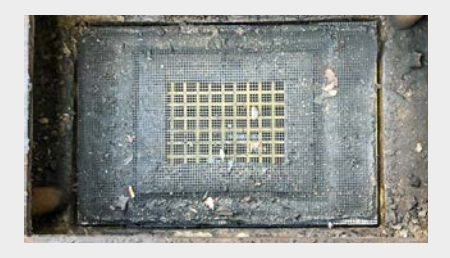
Stays in place. The storm drain insert will not fall into the drain.