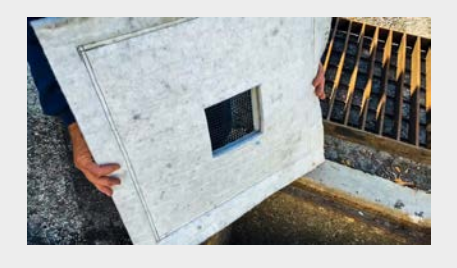
Overflow port prevents water from backing up in a heavy rain event.